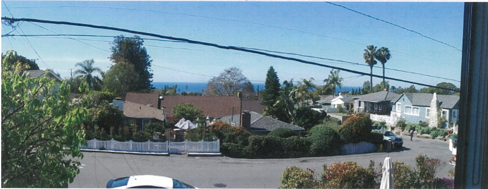
830 Wilson St.

The photograph above was taken from the living room on the upper level of the primary residential structure.