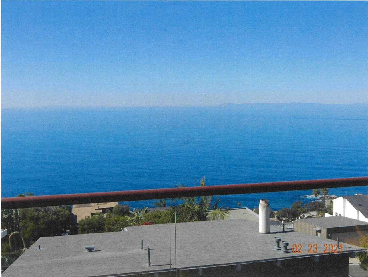
678 Alta Vista Way

The photograph above was taken from the dining room on the upper floor of the primary residential structure.