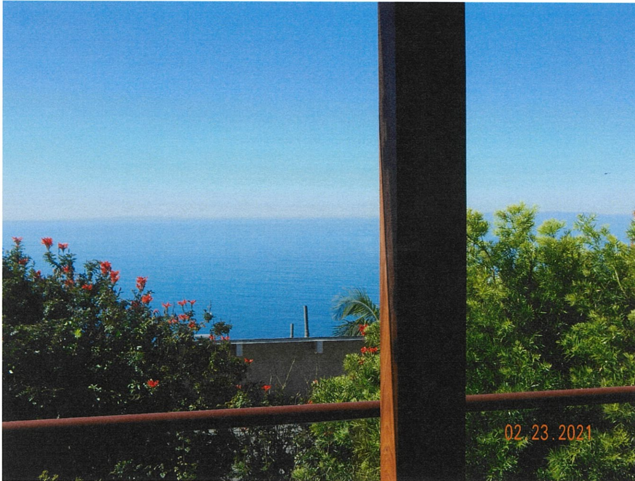
678 Alta Vista Way

The photograph above was taken from the guest bedroom on the lower floor of the primary residential structure.