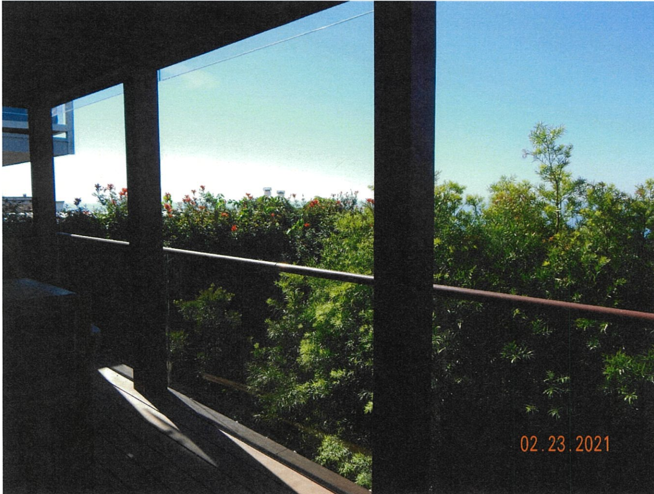
678 Alta Vista Way

The photograph above was taken from the master bedroom on the lower floor of the primary residential structure.