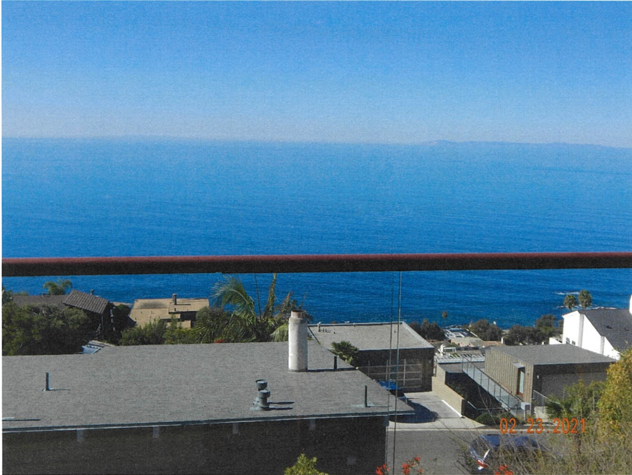
678 Alta Vista Way

The photograph above was taken from the living room on the upper floor of the primary residential structure.