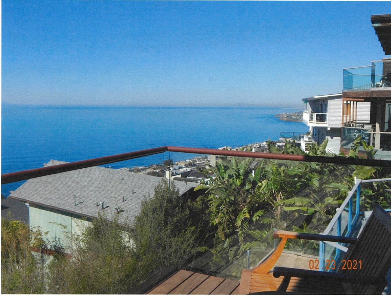
678 Alta Vista Way

The photograph above was taken from the living room on the upper floor of the primary residential structure.