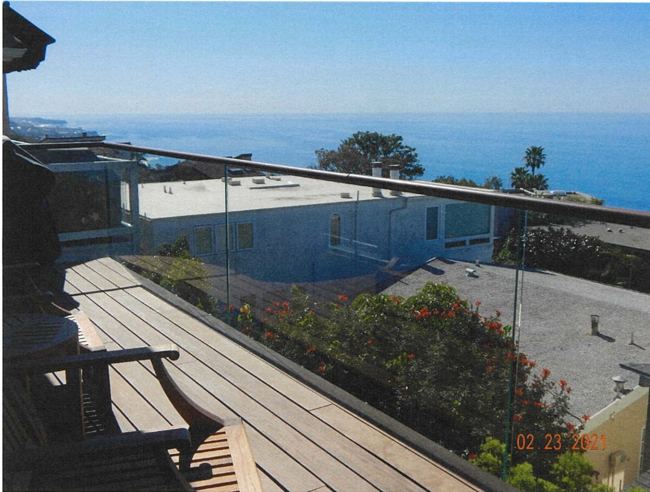
678 Alta Vista Way

The photograph above was taken from the living room on the upper floor of the primary residential structure.