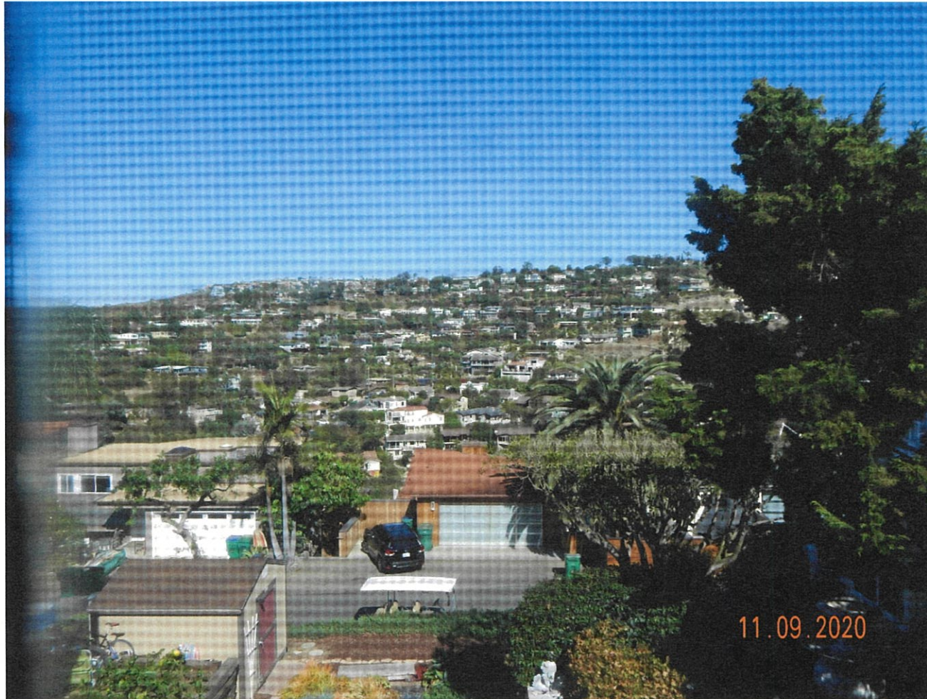
1016 Summit Way

The photograph above was taken from the master bedroom on the main floor of the primary residential structure.