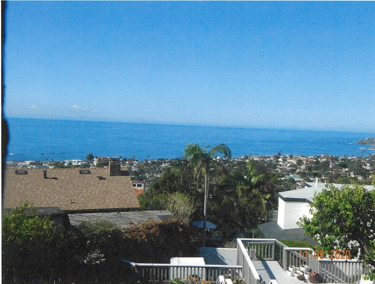
1016 Summit Way

The photograph above was taken from the living room on the main floor of the primary residential structure.