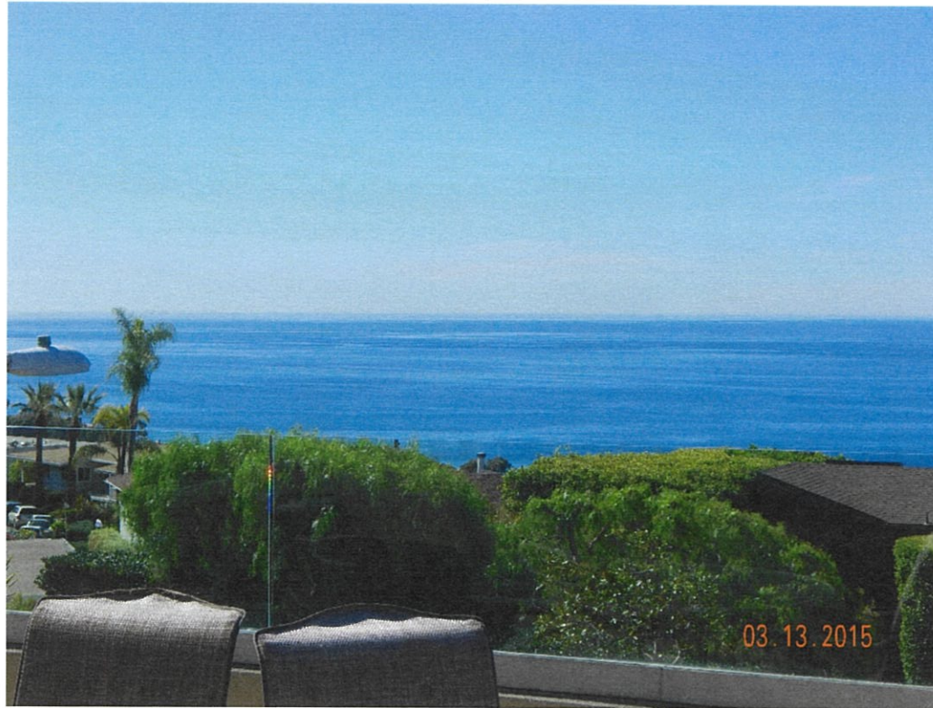
21617 Ocean Vista Dr.

The photograph above was taken from the property owners' living/dining room located in the primary structure.