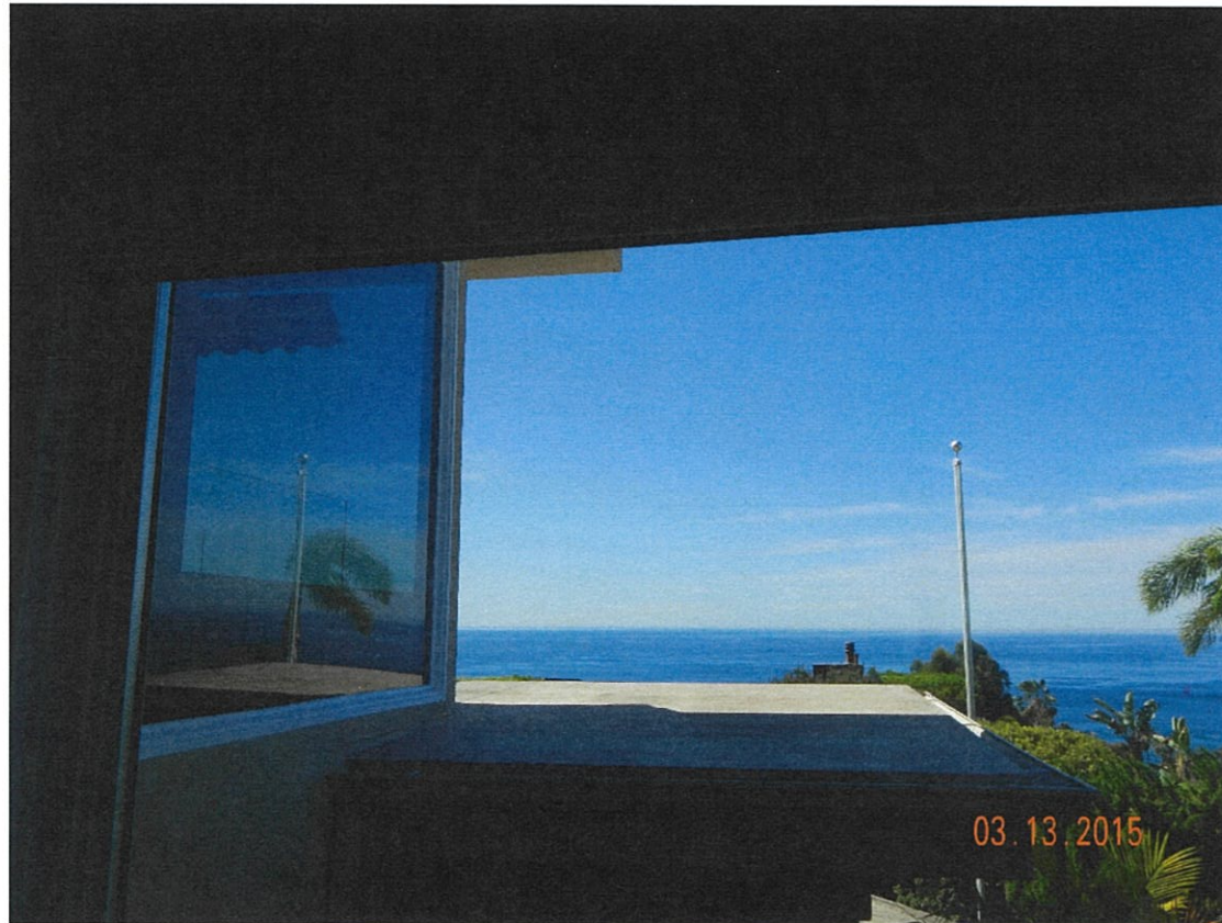
21617 Ocean Vista Dr.

The photograph above was taken from the property owners' guest bedroom located in the primary structure.