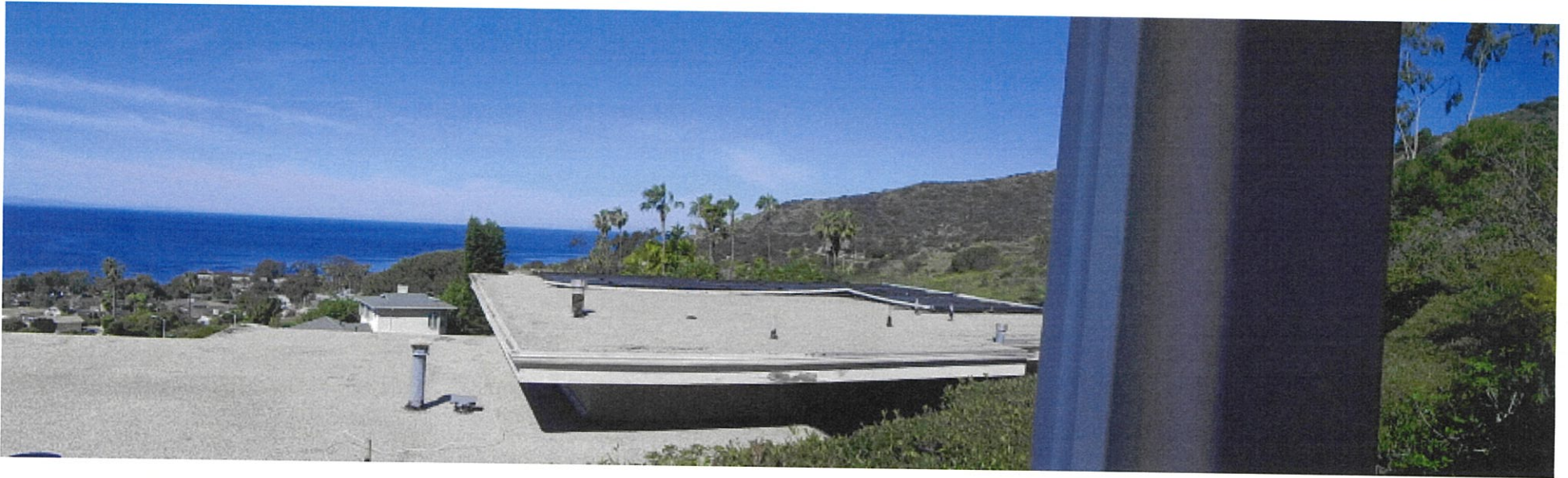
21617 Ocean Vista Dr.

The photograph above was taken from the property owners' master bedroom located in the primary structure.