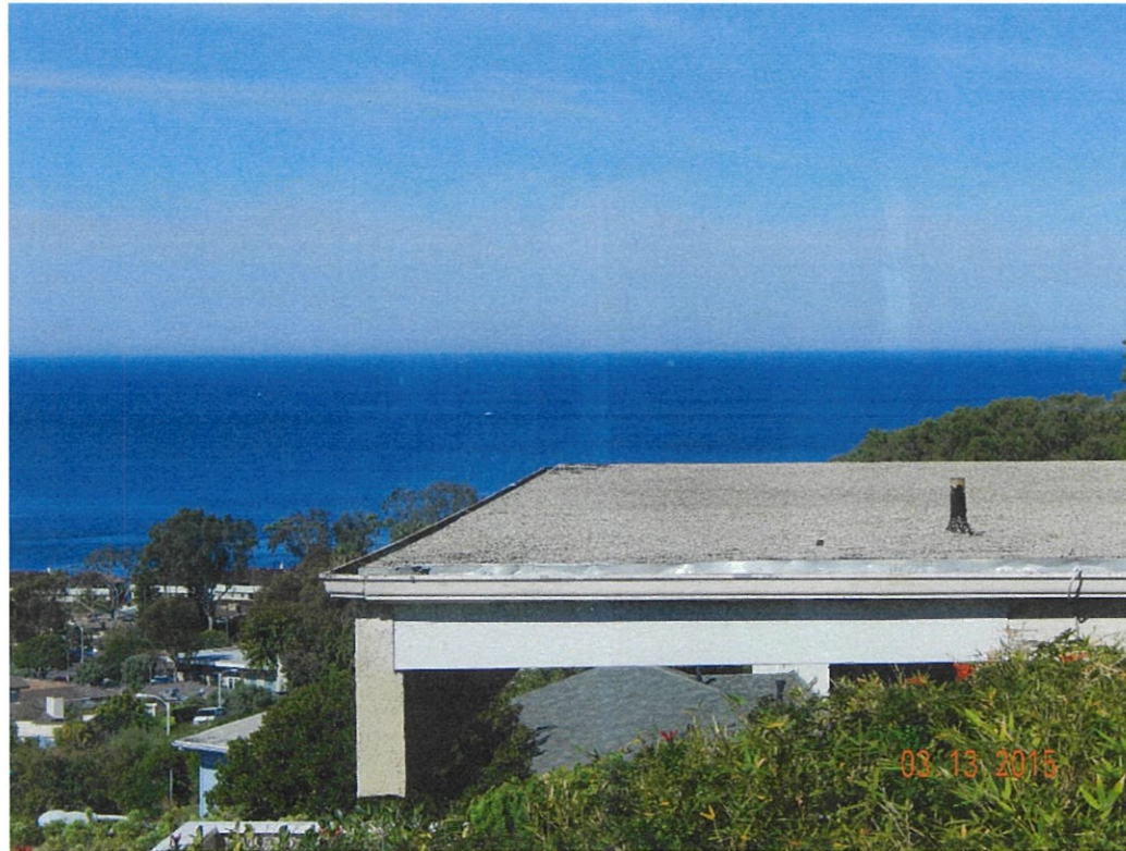
21617 Ocean Vista Dr.

The photograph above was taken from the property owners' living/dining room located in the primary structure.