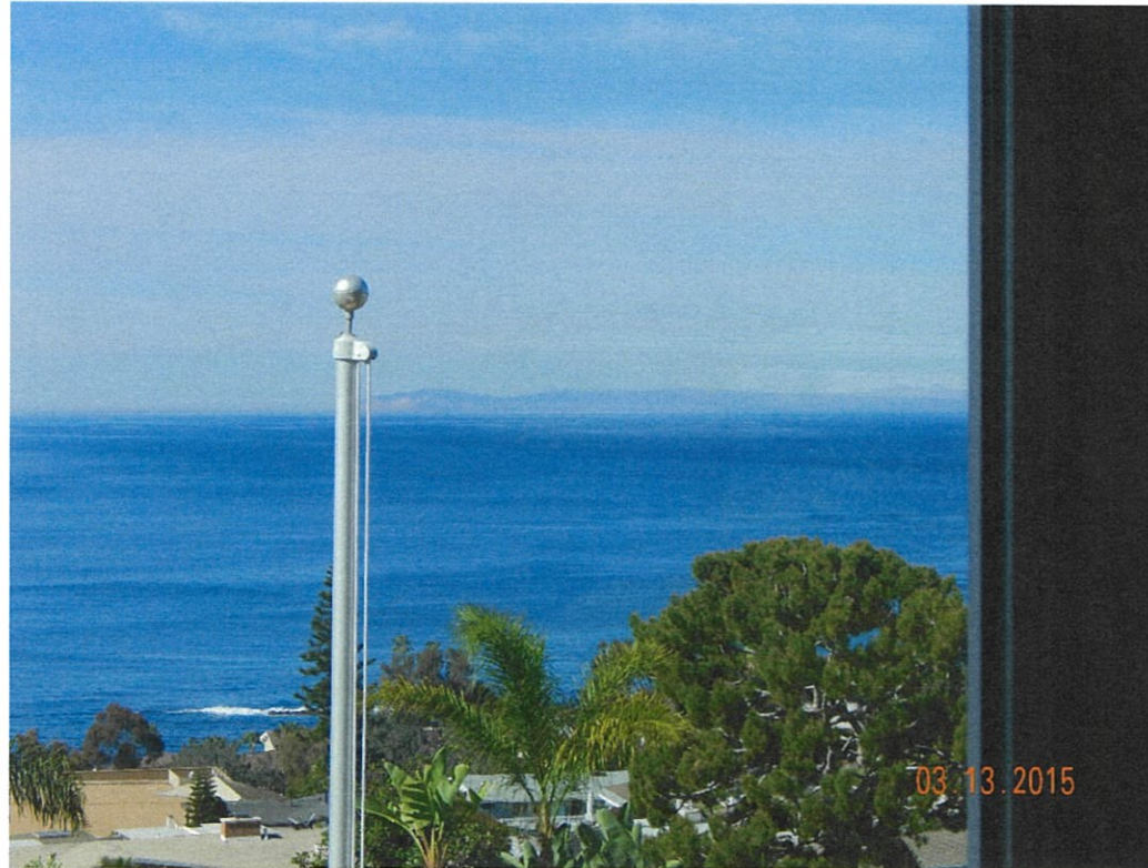
21617 Ocean Vista Dr.

The photograph above was taken from the property owners' living/dining room located in the primary structure.