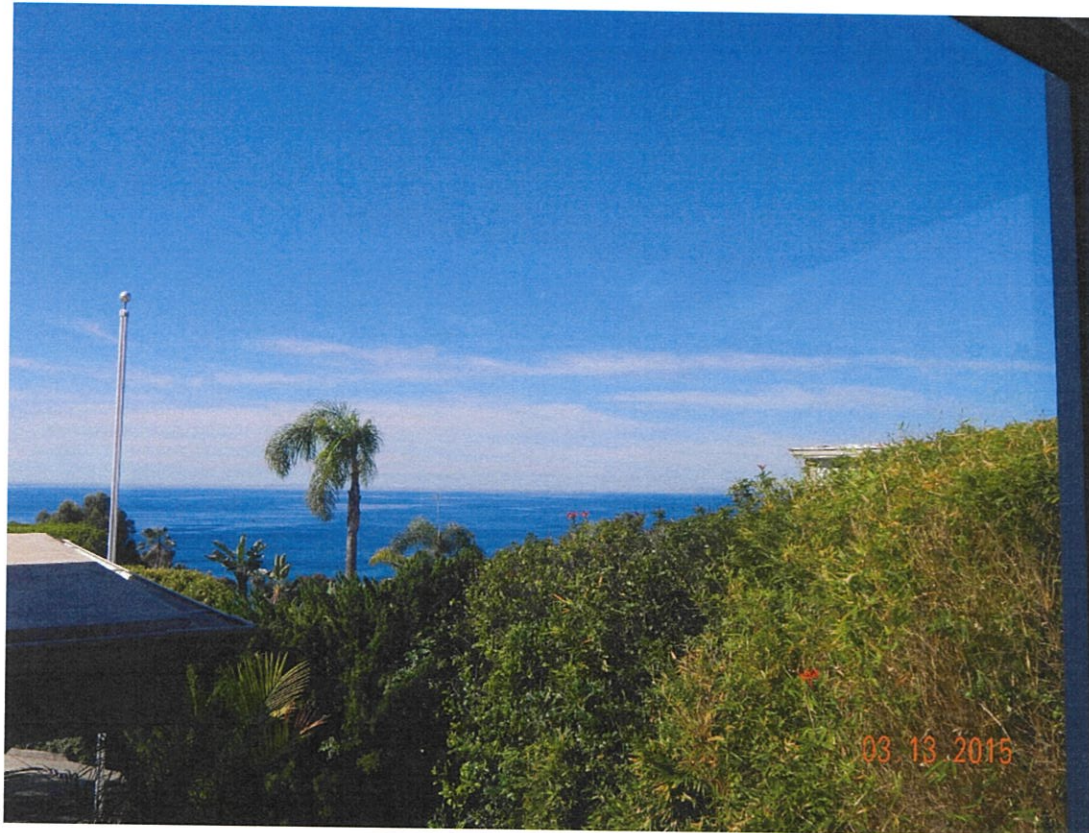
21617 Ocean Vista Dr.

The photograph above was taken from the property owners' guest bedroom located in the primary structure.