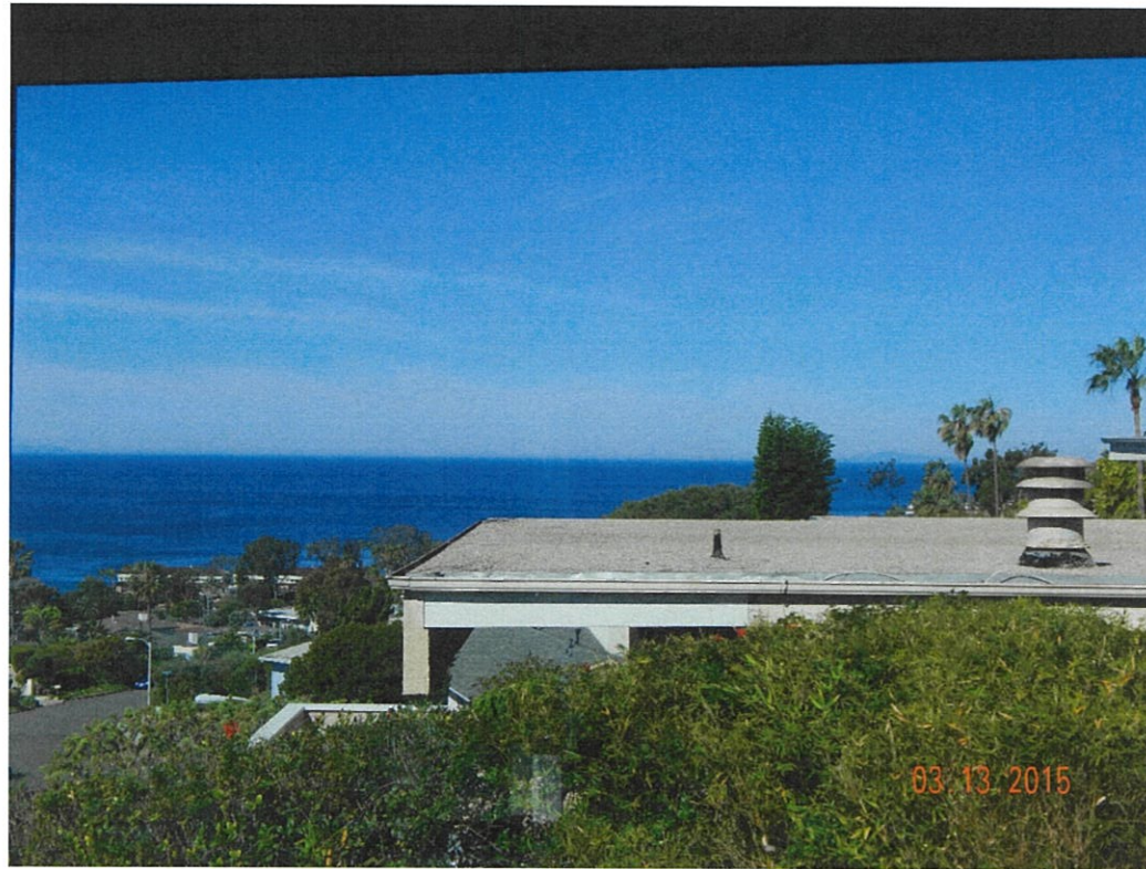
21617 Ocean Vista Dr.

The photograph above was taken from the property owners' living/dining room located in the primary structure.