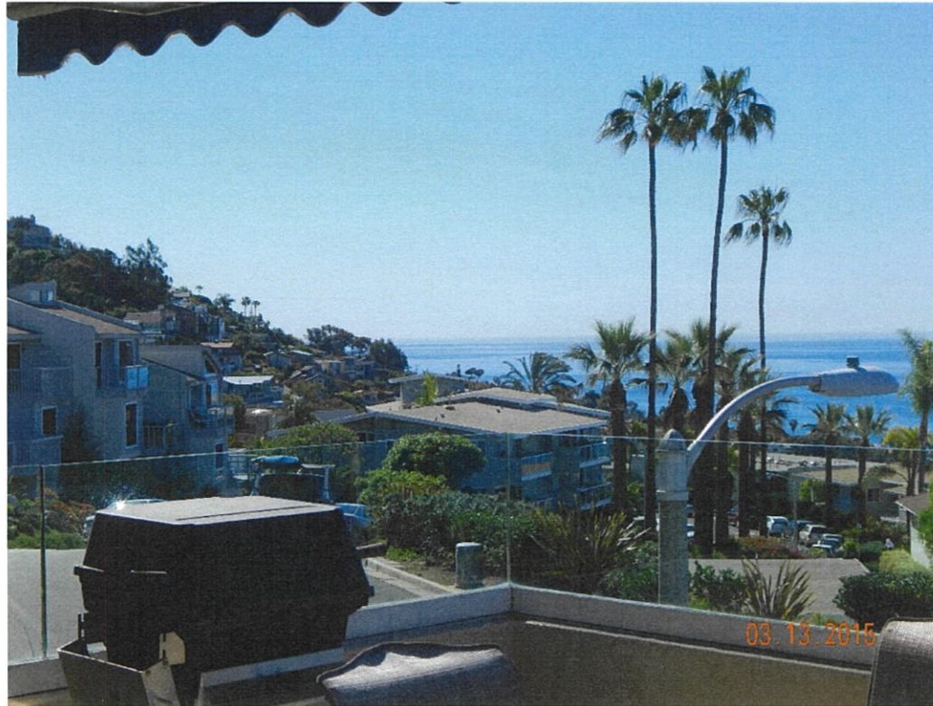
21617 Ocean Vista Dr.

The photograph above was taken from the property owners' living/dining room located in the primary structure.