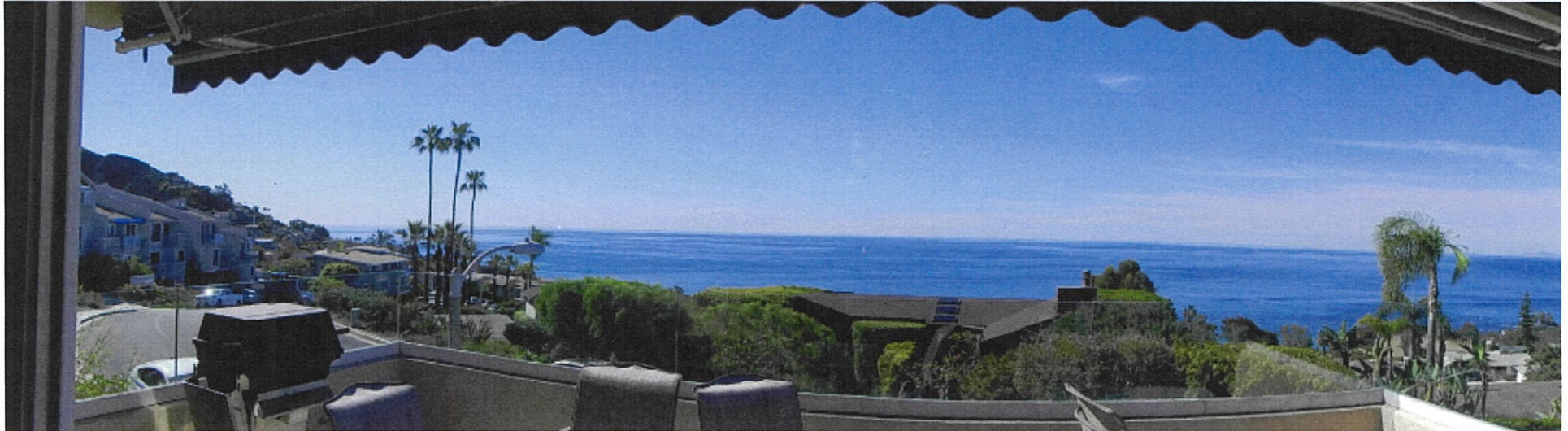
21617 Ocean Vista Dr.

The photograph above was taken from the property owners' living/dining room located in the primary structure.