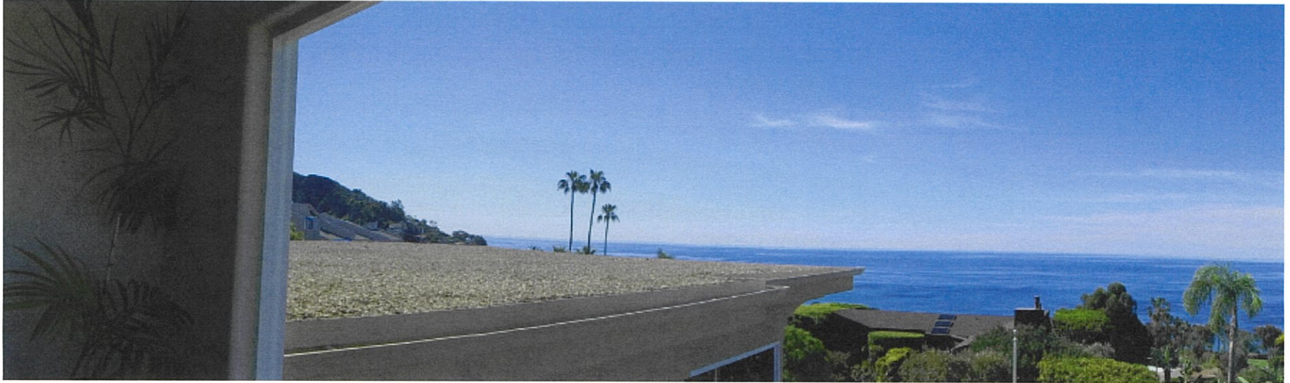
21617 Ocean Vista Dr.

The photograph above was taken from the property owners' master bedroom located in the primary structure.