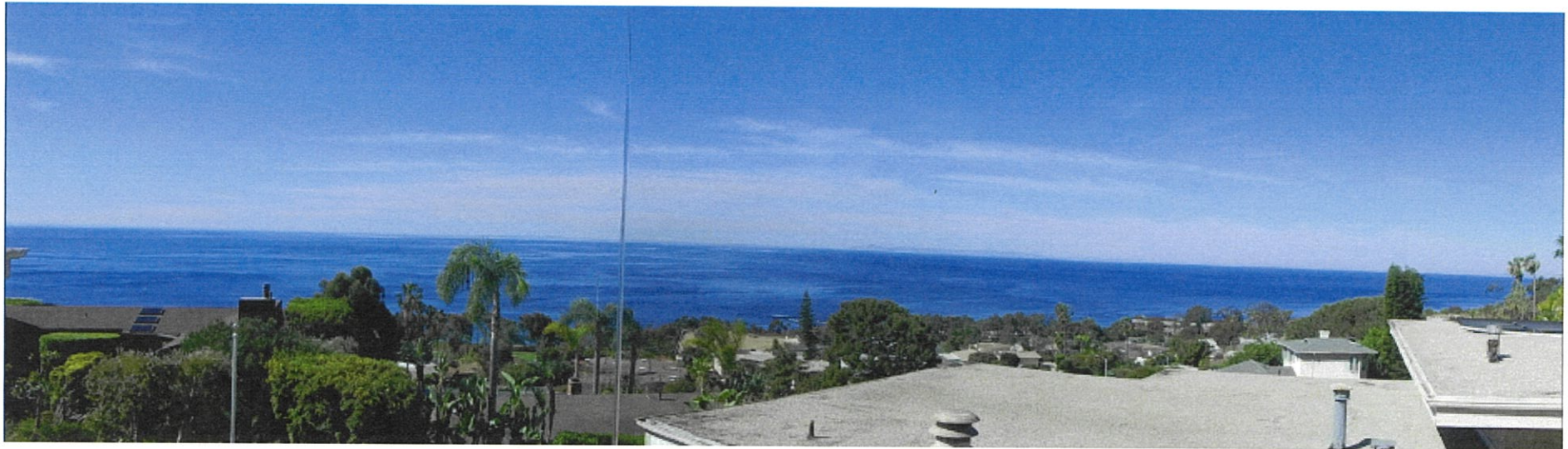
21617 Ocean Vista Dr.

The photograph above was taken from the property owners' master bedroom located in the primary structure.