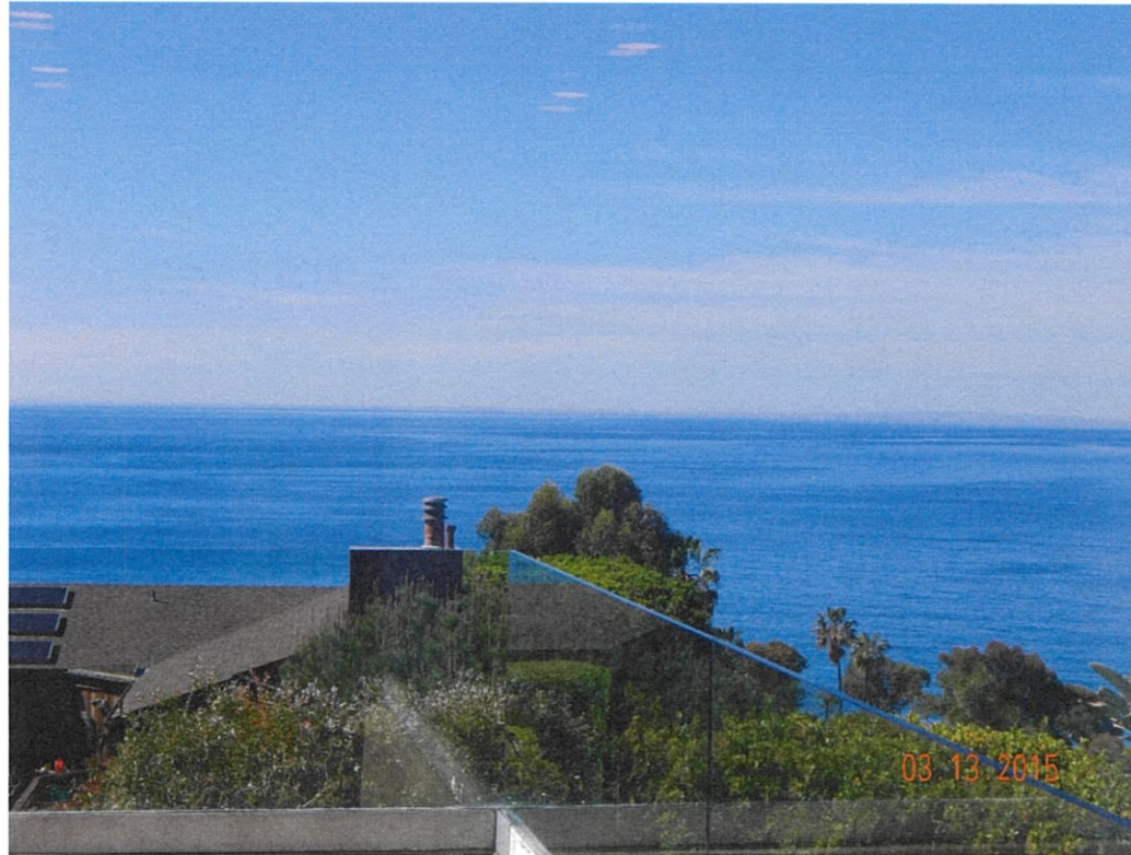
21617 Ocean Vista Dr.

The photograph above was taken from the property owners' living/dining room located in the primary structure.