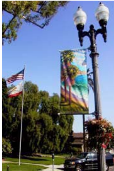
Flags on flagpole, gonfalon on lamppost