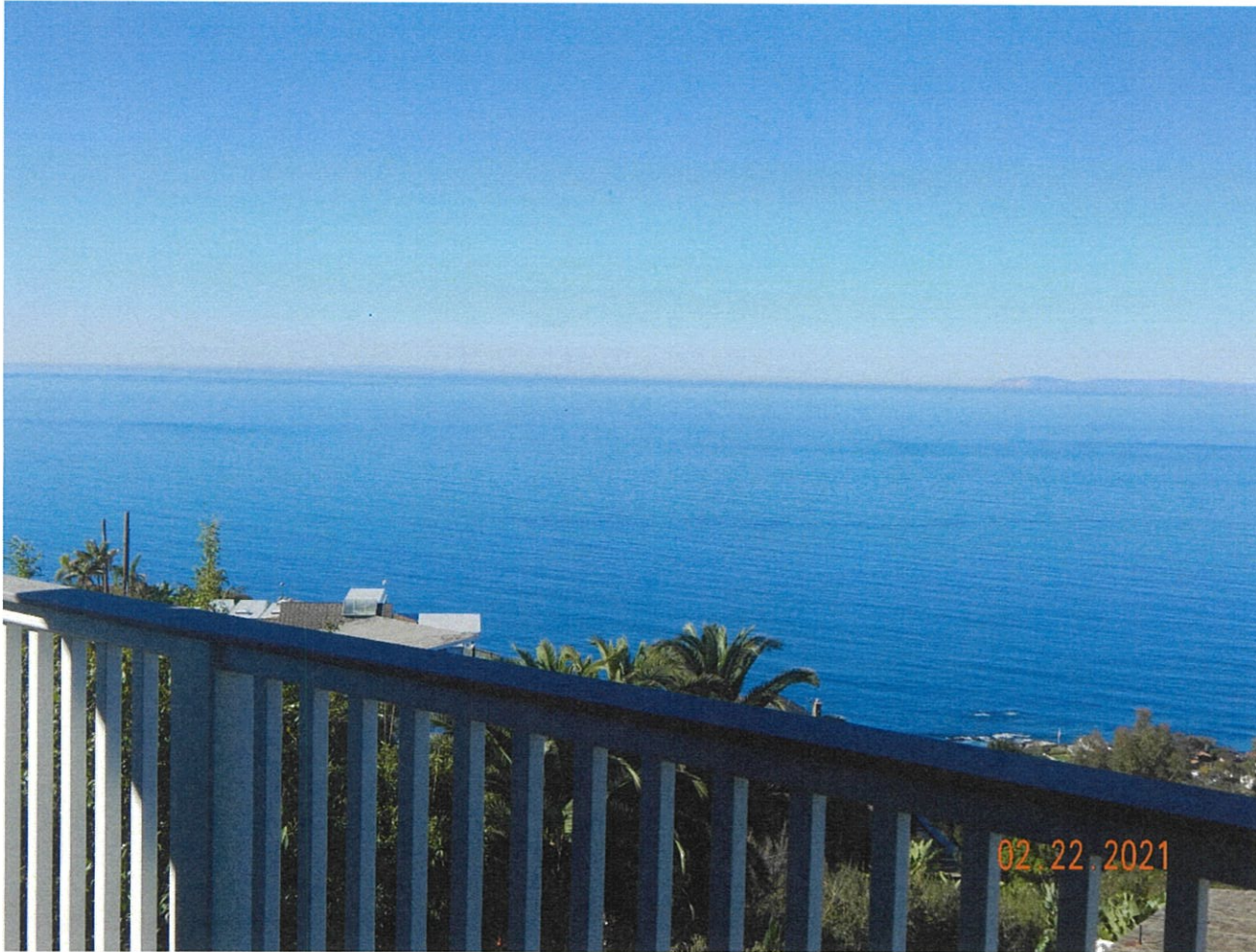
815 La Mirada

The photograph above was taken from the living room on the main floor of the primary residential unit.