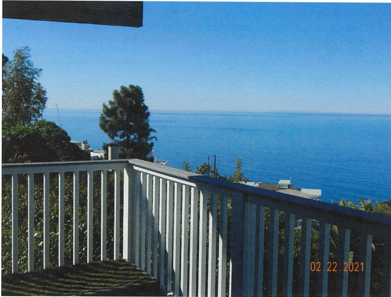
815 La Mirada

The photograph above was taken from the living room on the main floor of the primary residential unit.