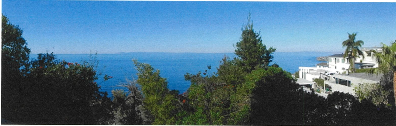
815 La Mirada

The photograph above was taken from the bedroom on the lower floor of the primary residential unit.