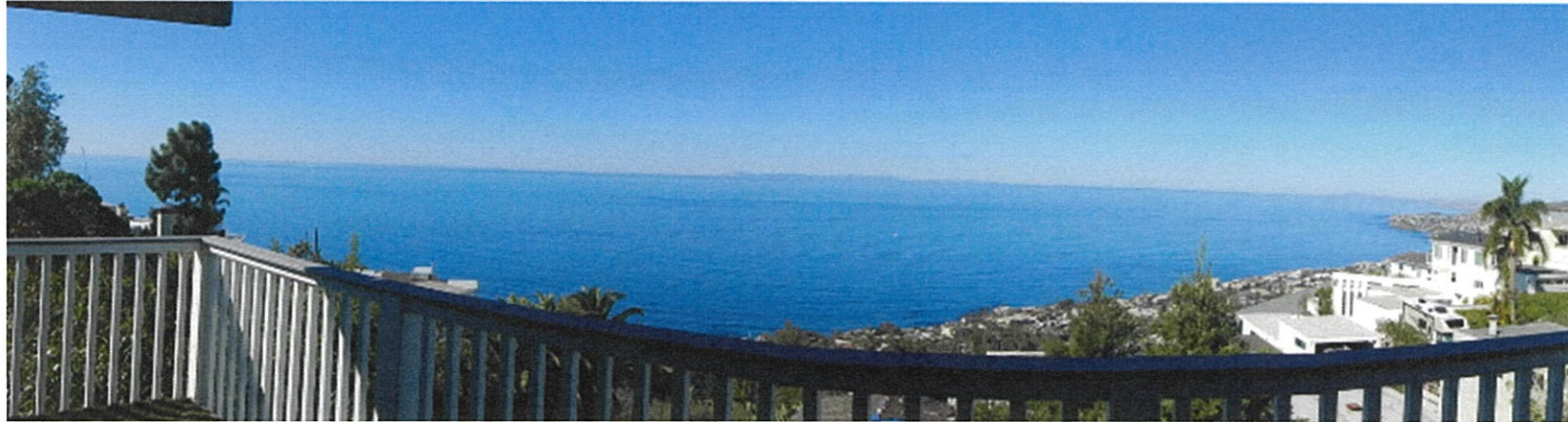
815 La Mirada

The photograph above was taken from the living room on the main floor of the primary residential unit.