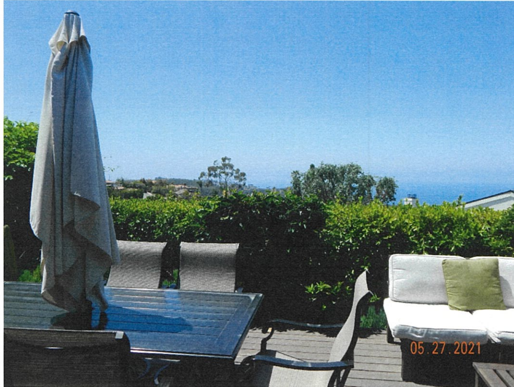
2975 Chillon Way

The photograph above was taken from the living room/dining room on the main floor of the primary residential structure.