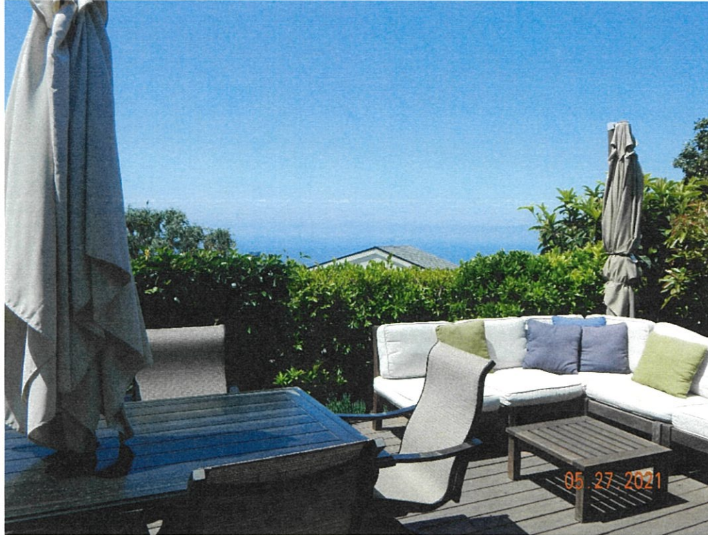
2975 Chillon Way

The photograph above was taken from the living room/dining room on the main floor of the primary residential structure.