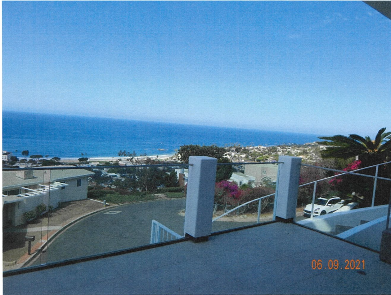
612 Vista Lane

The photograph above was taken from the master bedroom on the lower level of the primary residential structure.