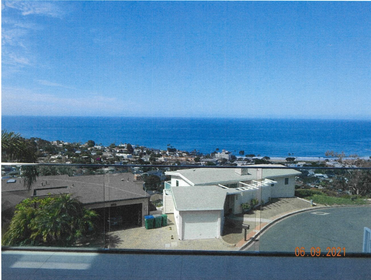
612 Vista Lane

The photograph above was taken from the master bedroom on the lower level of the primary residential structure.