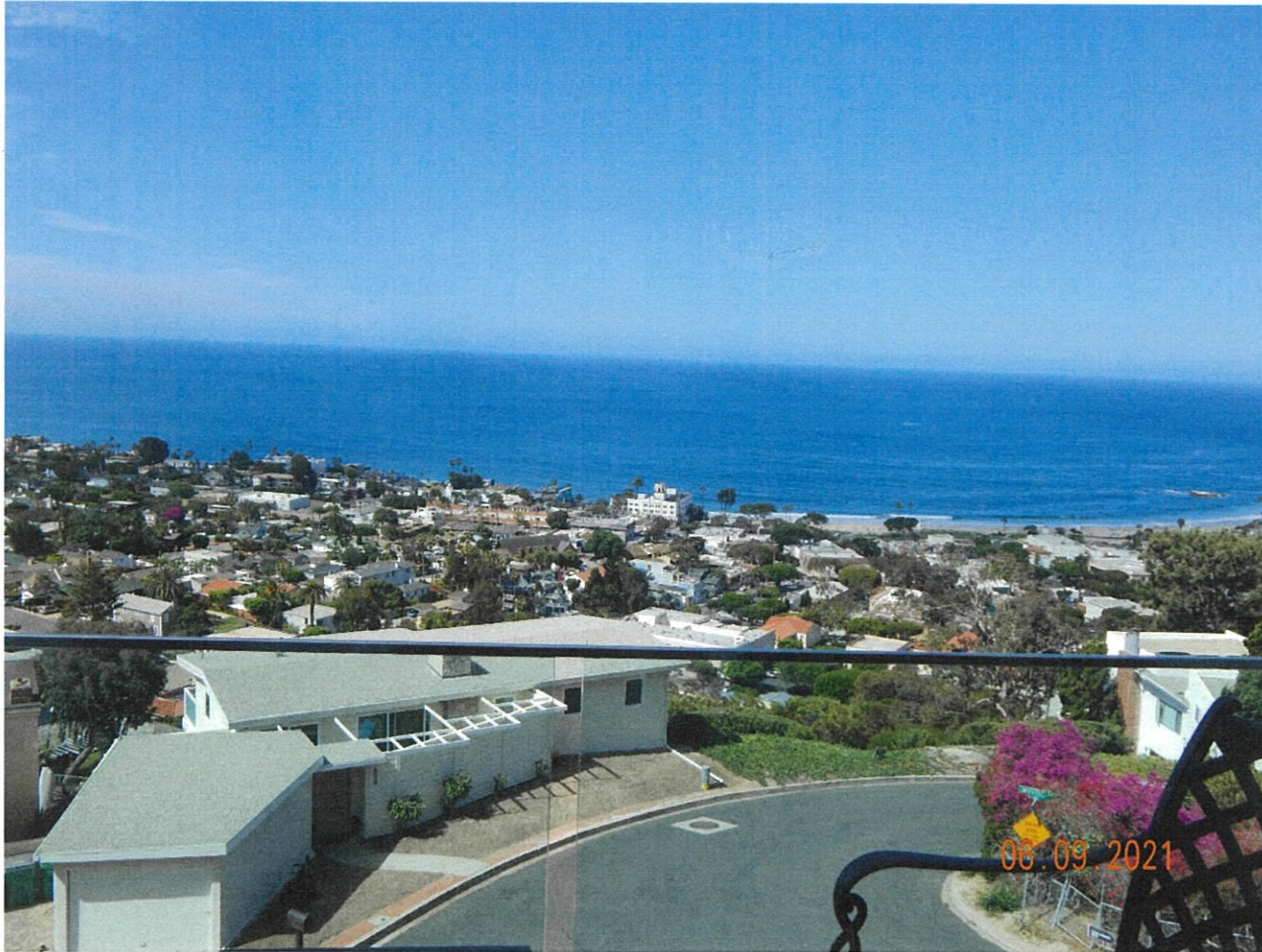
612 Vista Lane

The photograph above was taken from the kitchen on the main level of the primary residential structure.