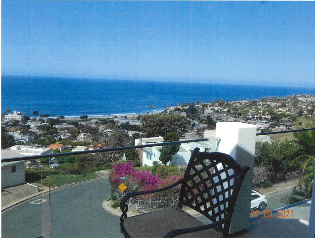
612 Vista Lane

The photograph above was taken from the kitchen on the main level of the primary residential structure.