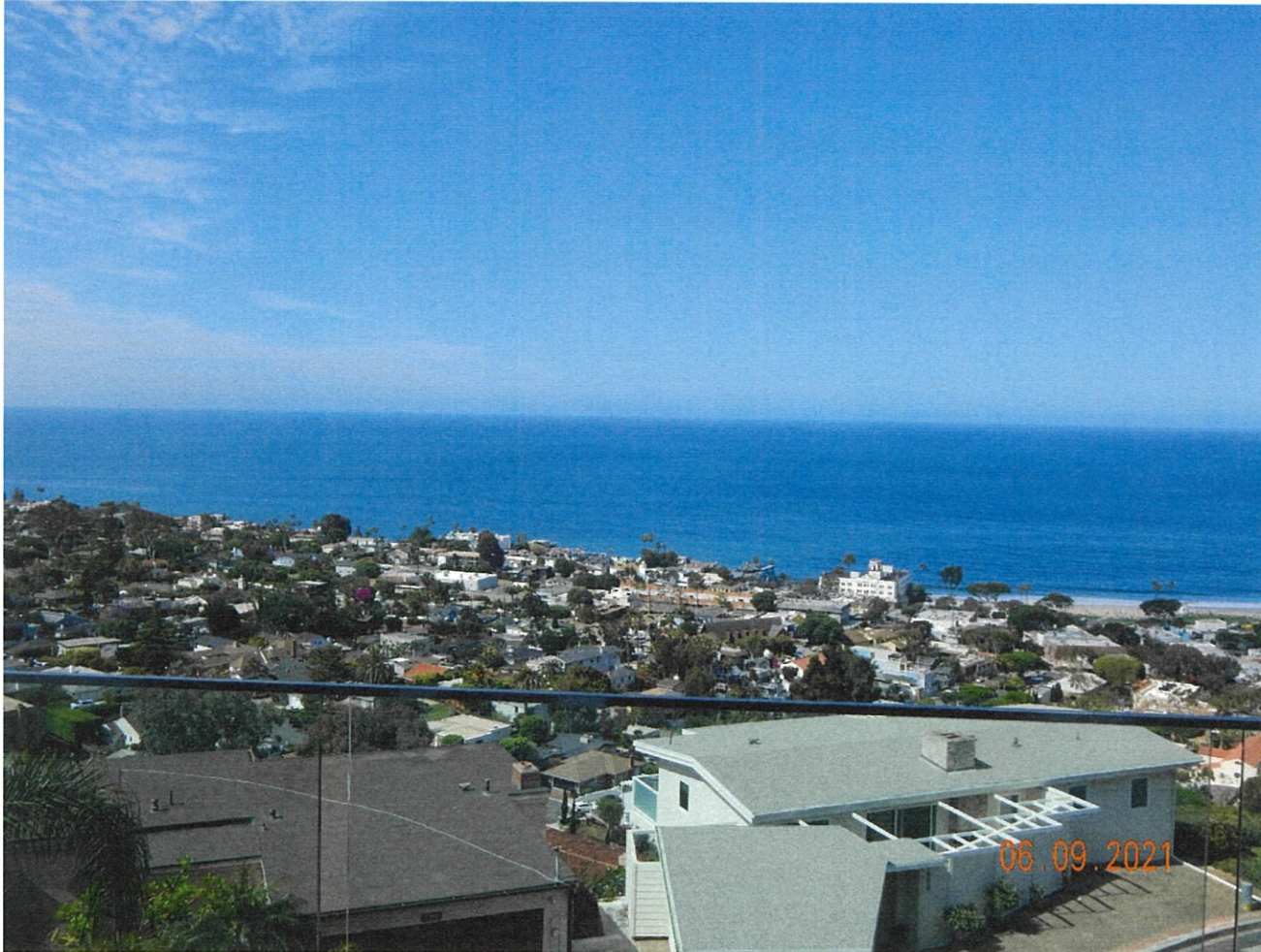
612 Vista Lane

The photograph above was taken from the living room on the main level of the primary residential structure.