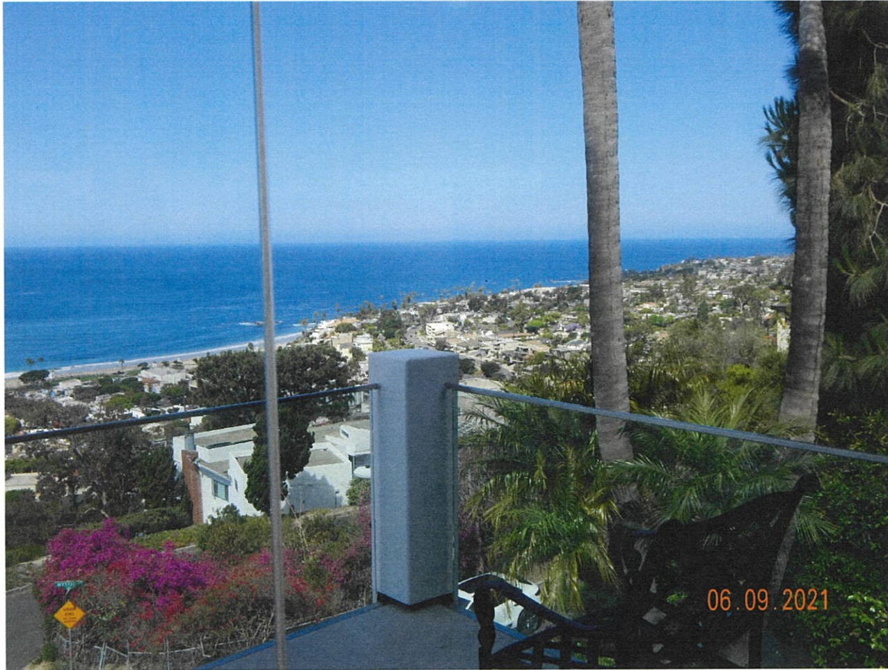
612 Vista Lane

The photograph above was taken from the kitchen on the main level of the primary residential structure.