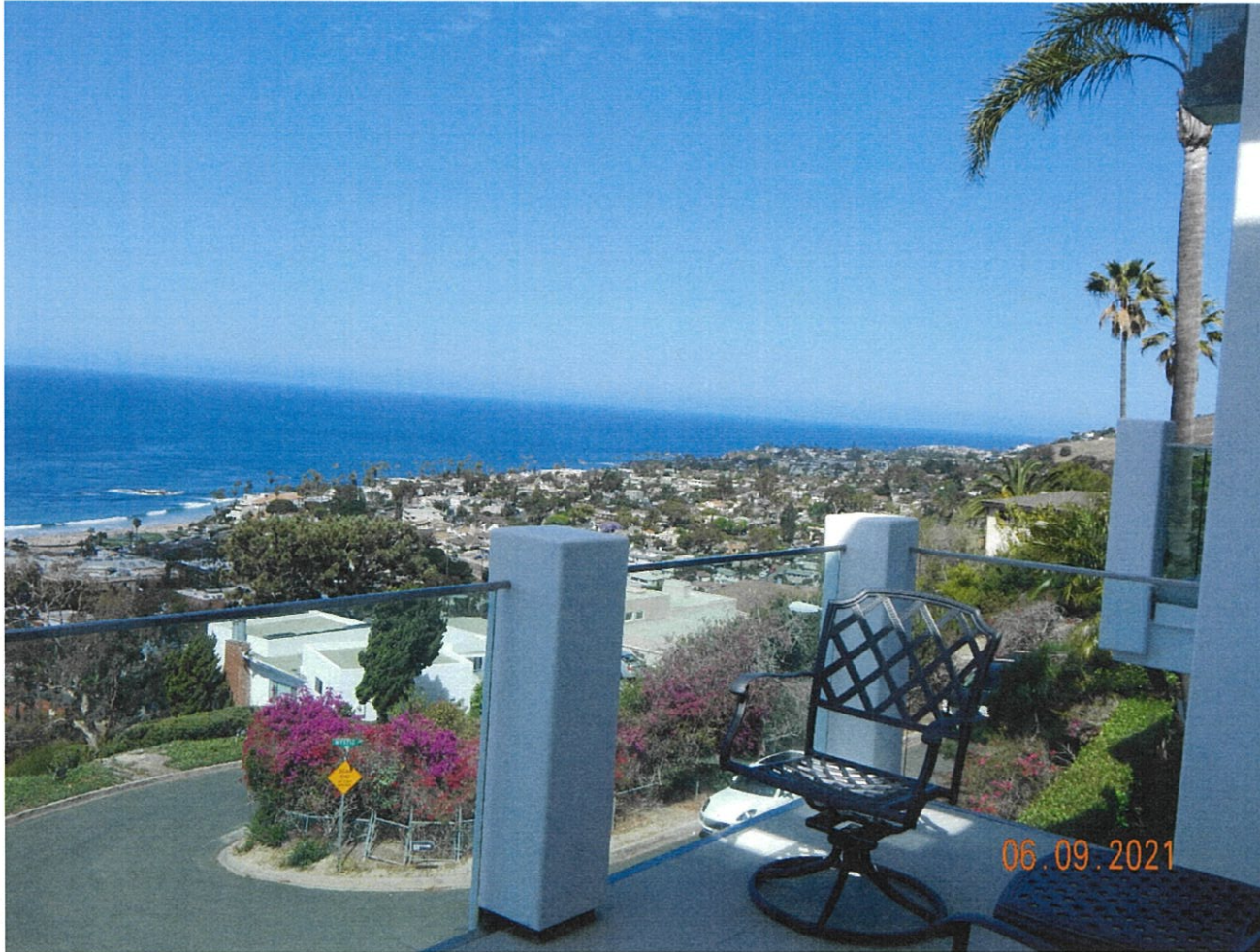
612 Vista Lane

The photograph above was taken from the living room on the main level of the primary residential structure.