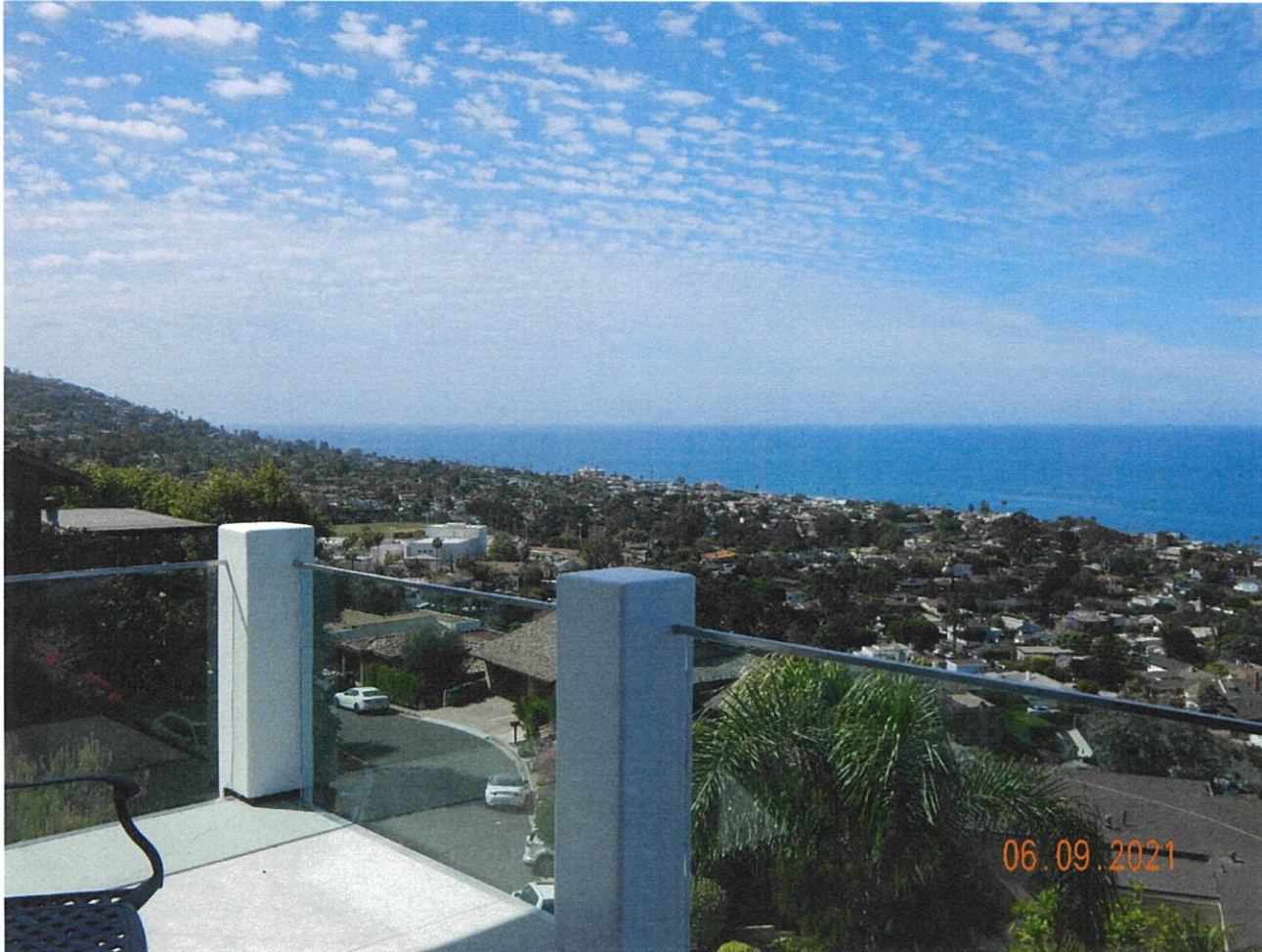
612 Vista Lane

The photograph above was taken from the living room on the main level of the primary residential structure.