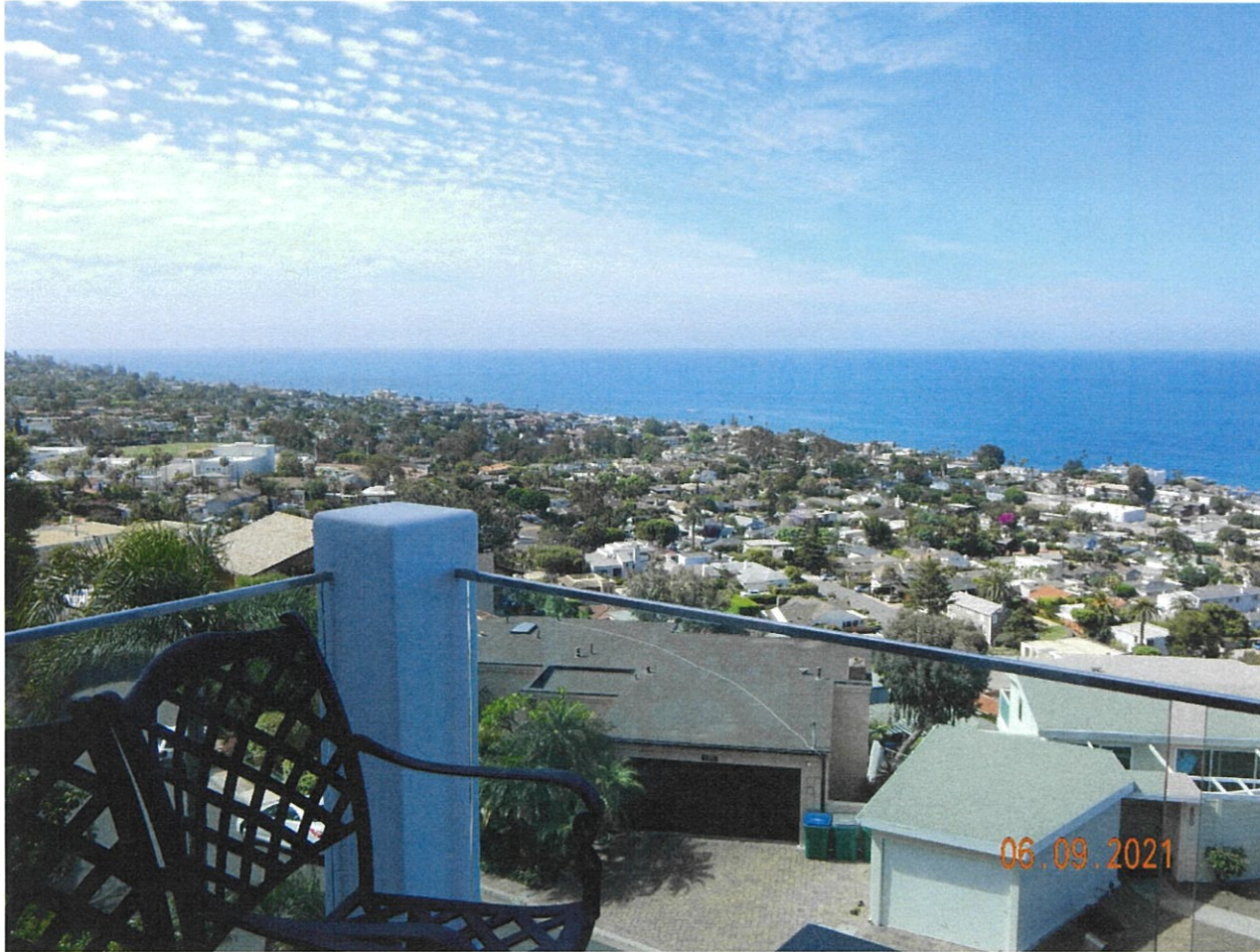
612 Vista Lane

The photograph above was taken from the kitchen on the main level of the primary residential structure.