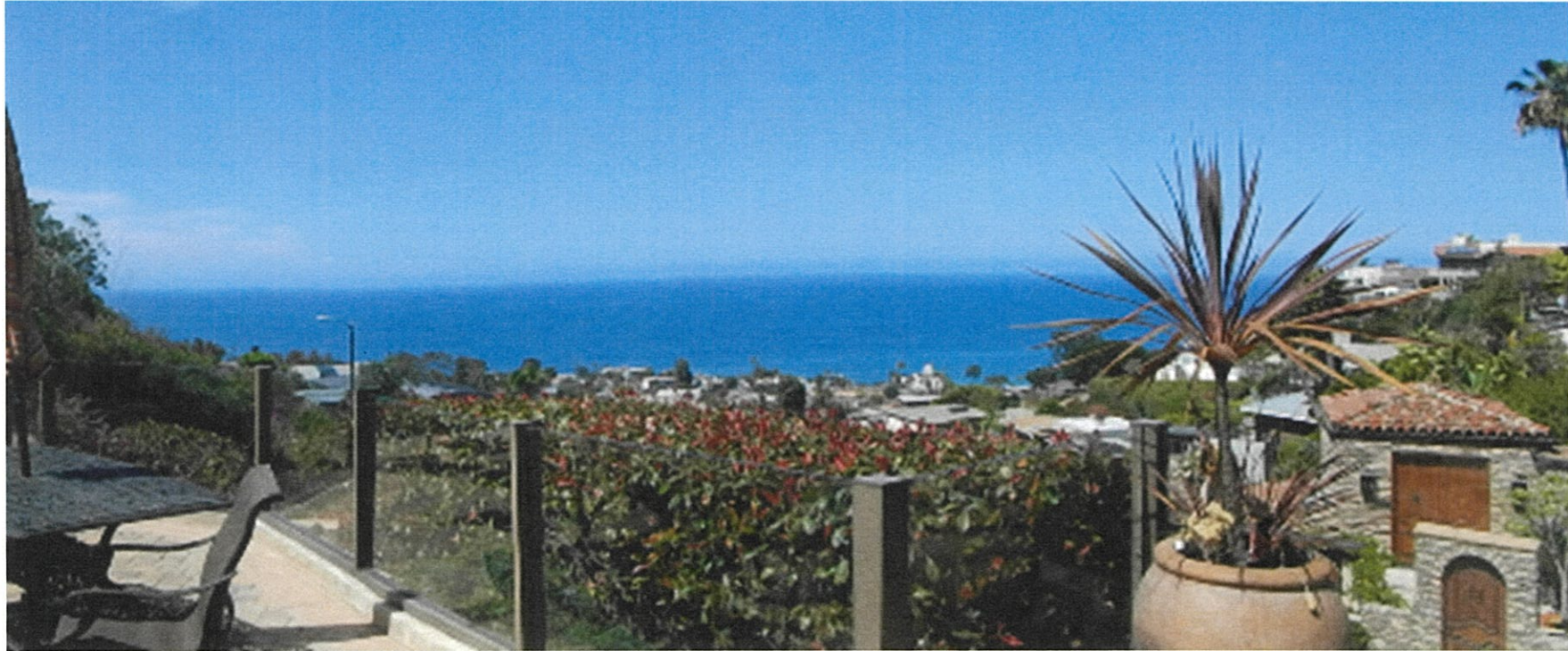
1106 Skyline Drive

The photograph above was taken from the master bedroom on the main floor of the primary residential structure.