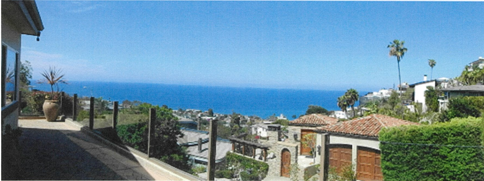
1106 Skyline Drive

The photograph above was taken from the dining room/kitchen on the main floor of the primary residential structure.