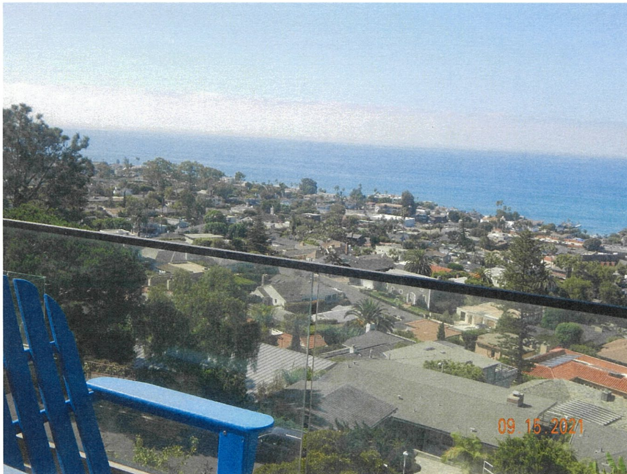
586 Mystic Way

The photograph above was taken from the guest bedroom on the middle level of the primary residential structure.