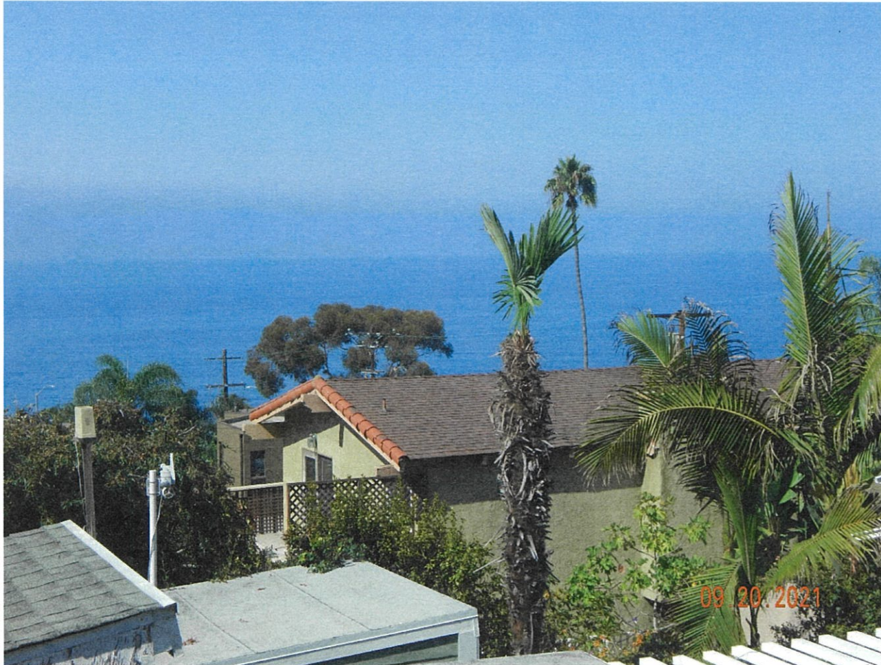
31911 Crestwood Place

The photograph above was taken from the master bedroom on the upper level of the primary residential structure.