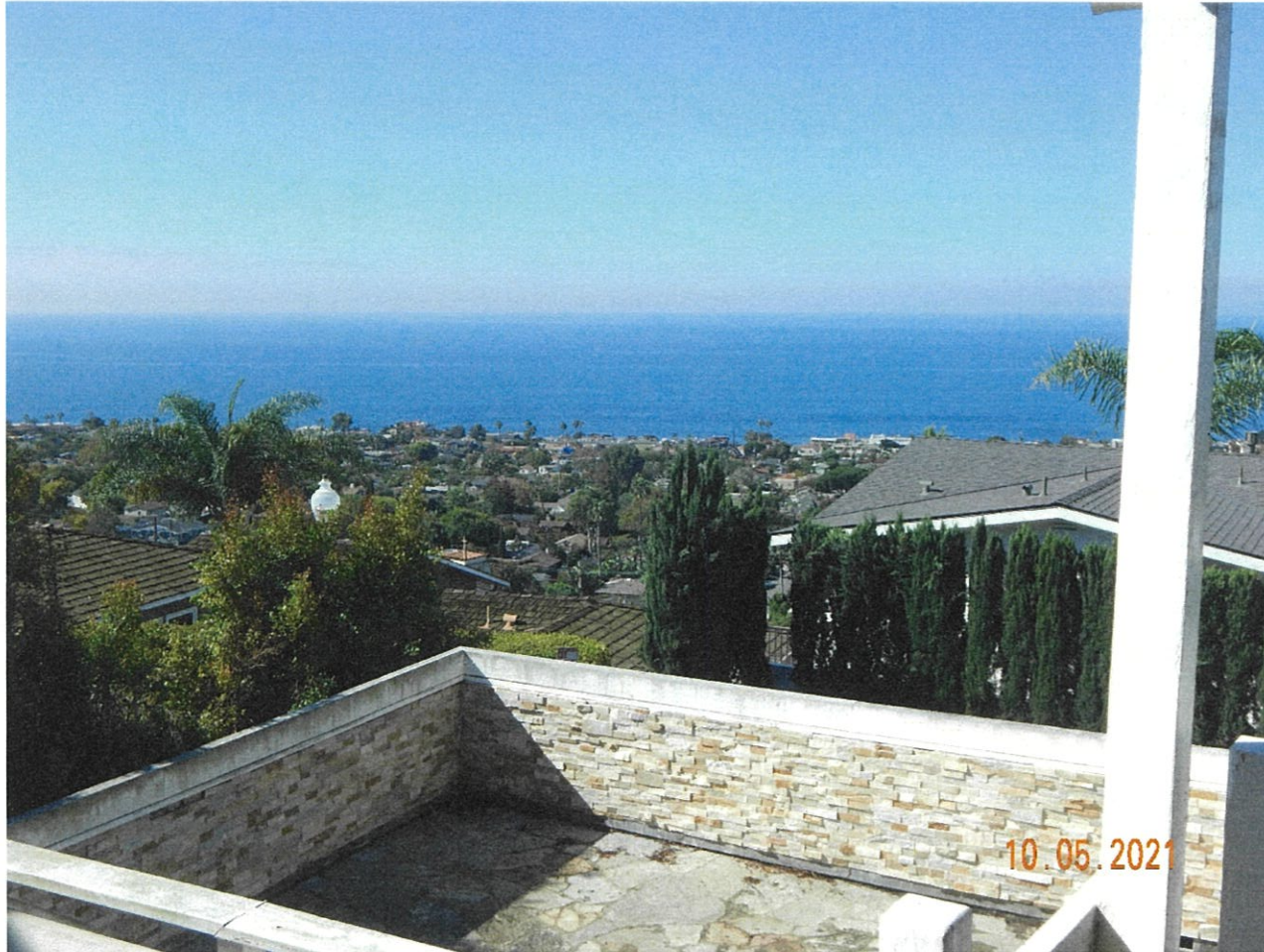
966 Coast View Dr.

The photograph above was taken from the living room on the main level of the primary residential structure.