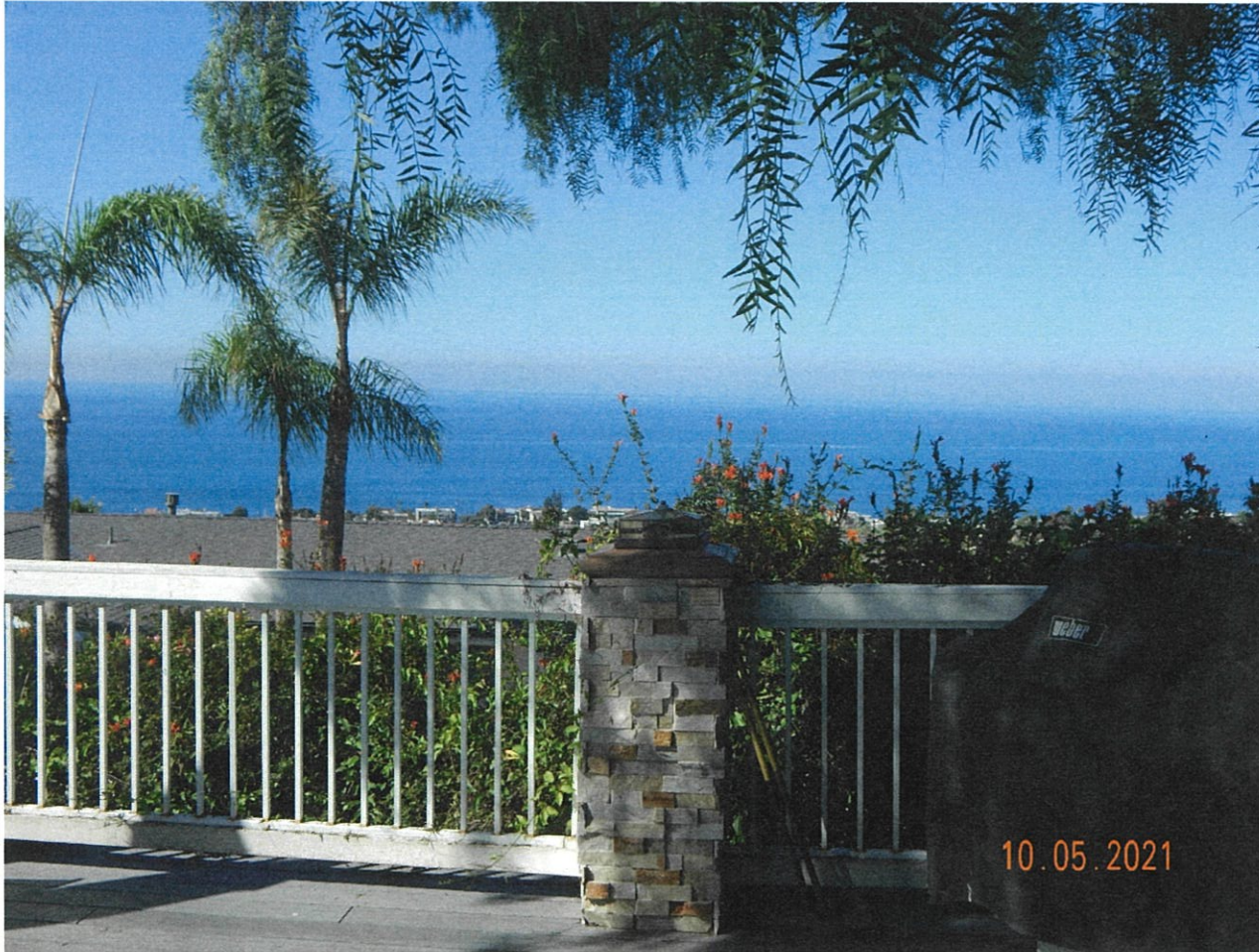
966 Coast View Dr.

The photograph above was taken from the master bedroom on the main level of the primary residential structure.