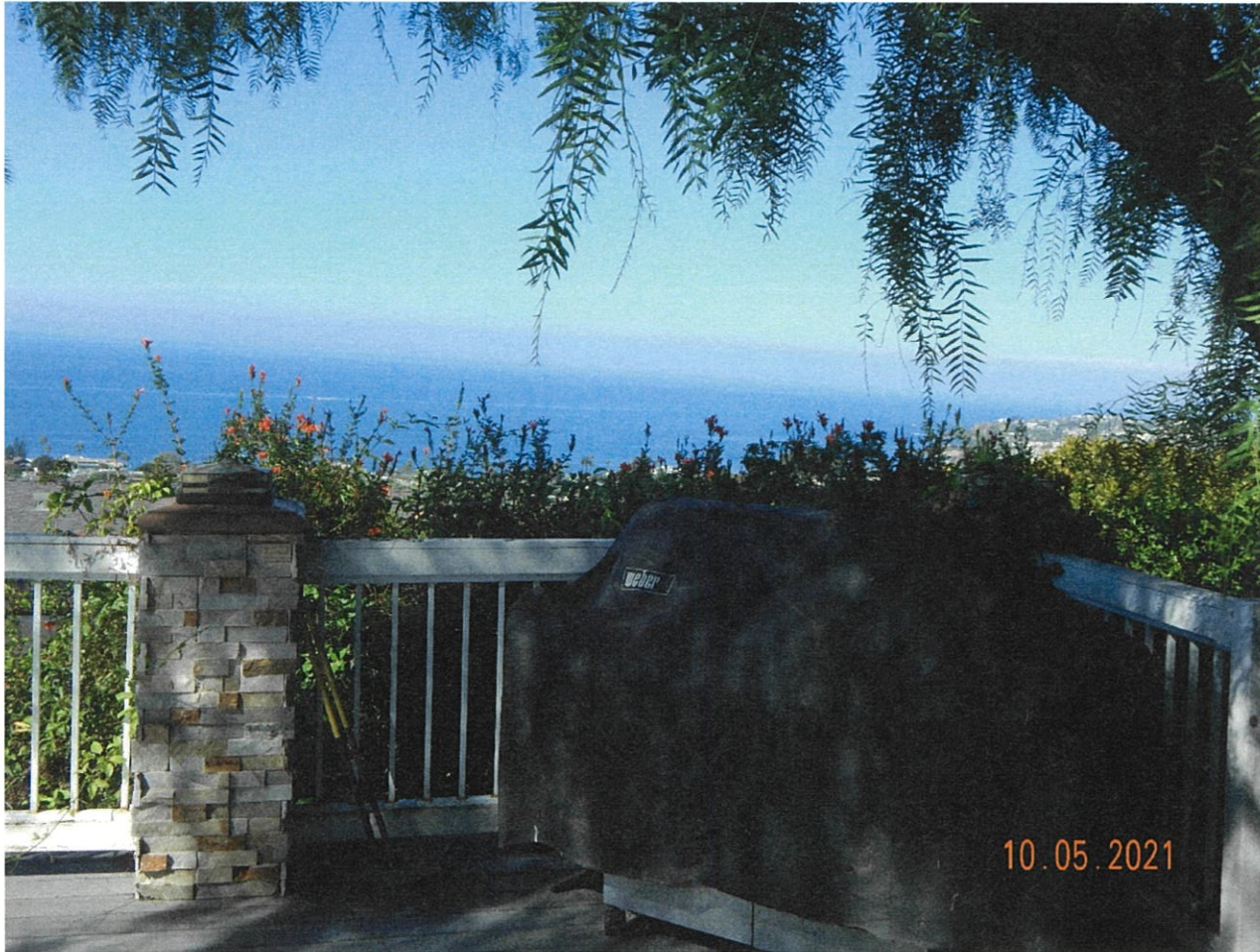
966 Coast View Dr.

The photograph above was taken from the master bedroom on the main level of the primary residential structure.