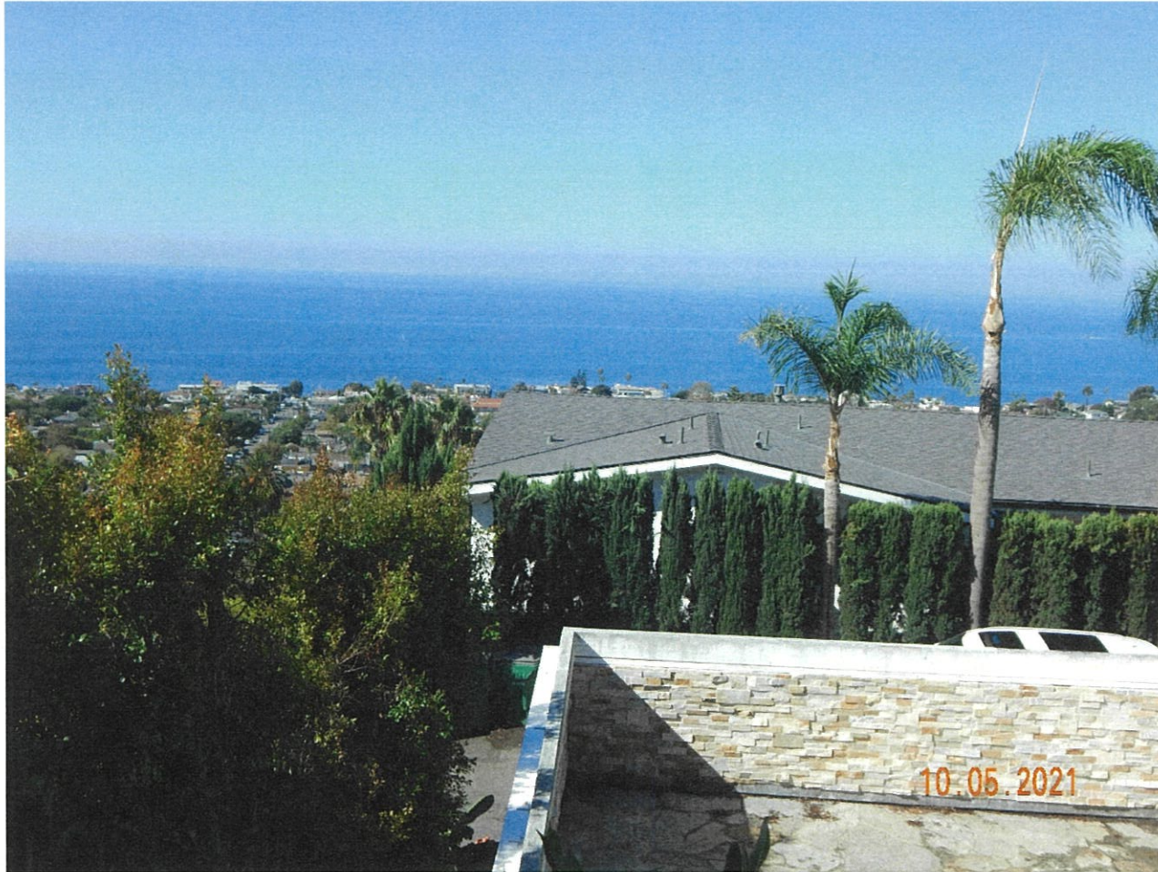
966 Coast View Dr.

The photograph above was taken from the kitchen/dining room on the main level of the primary residential structure.