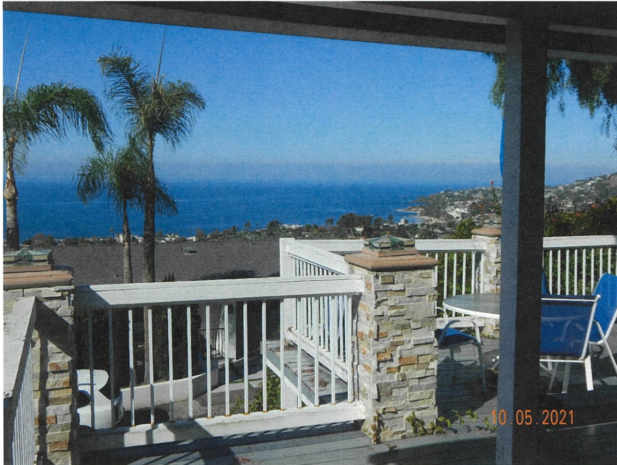
966 Coast View Dr.

The photograph above was taken from the living room on the main level of the primary residential structure.