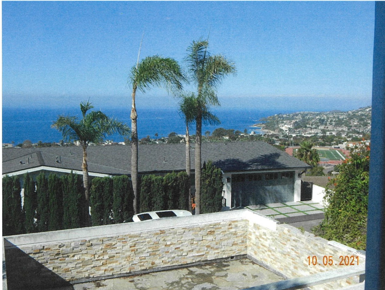
966 Coast View Dr.

The photograph above was taken from the kitchen/dining room on the main level of the primary residential structure.