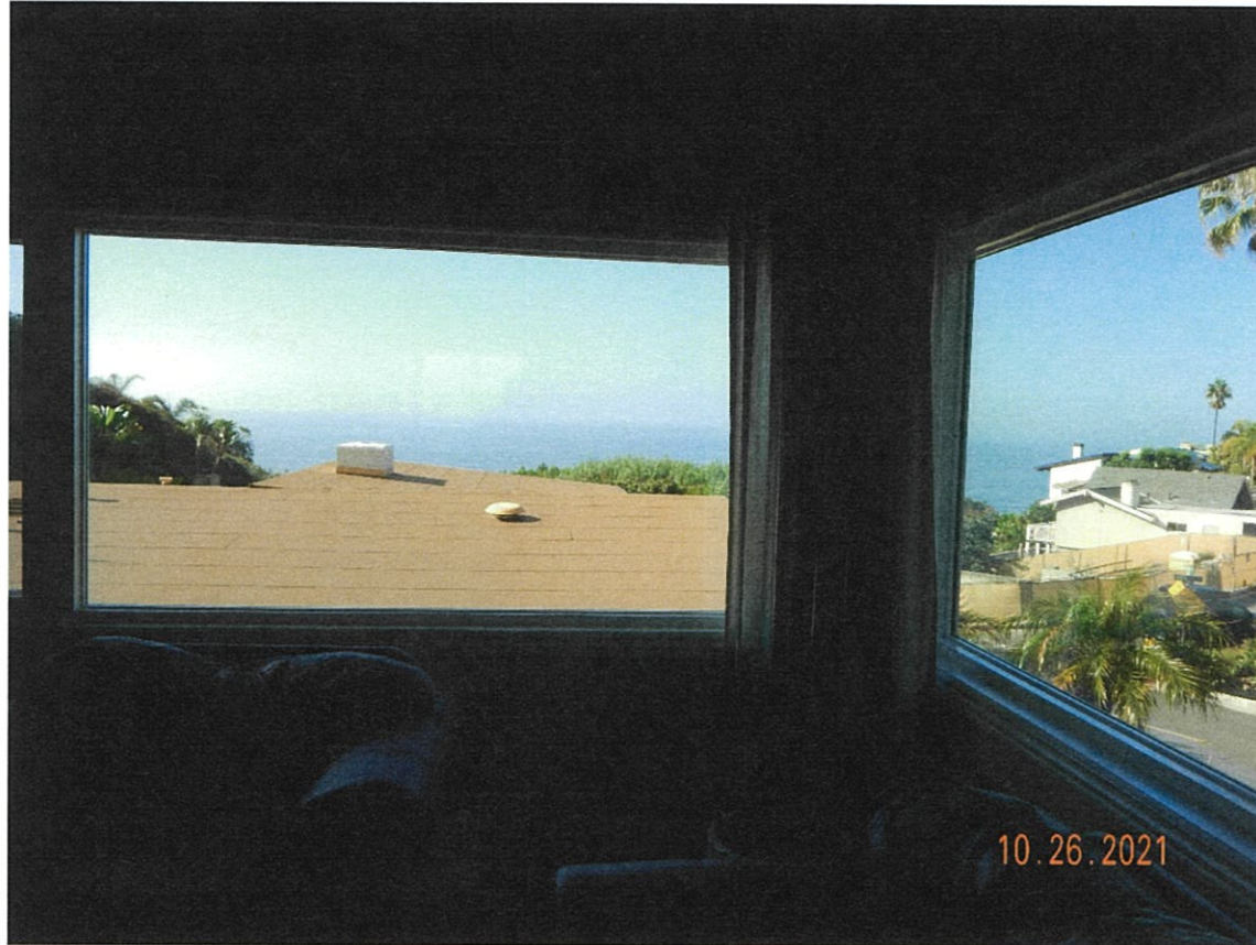
1126 Skyline Dr.

The photograph above was taken from the living room on the main level of the primary residential structure.