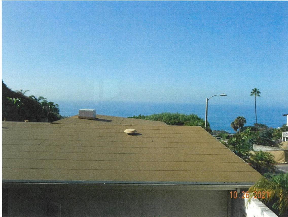
1126 Skyline Dr.

The photograph above was taken from the living room on the main level of the primary residential structure.