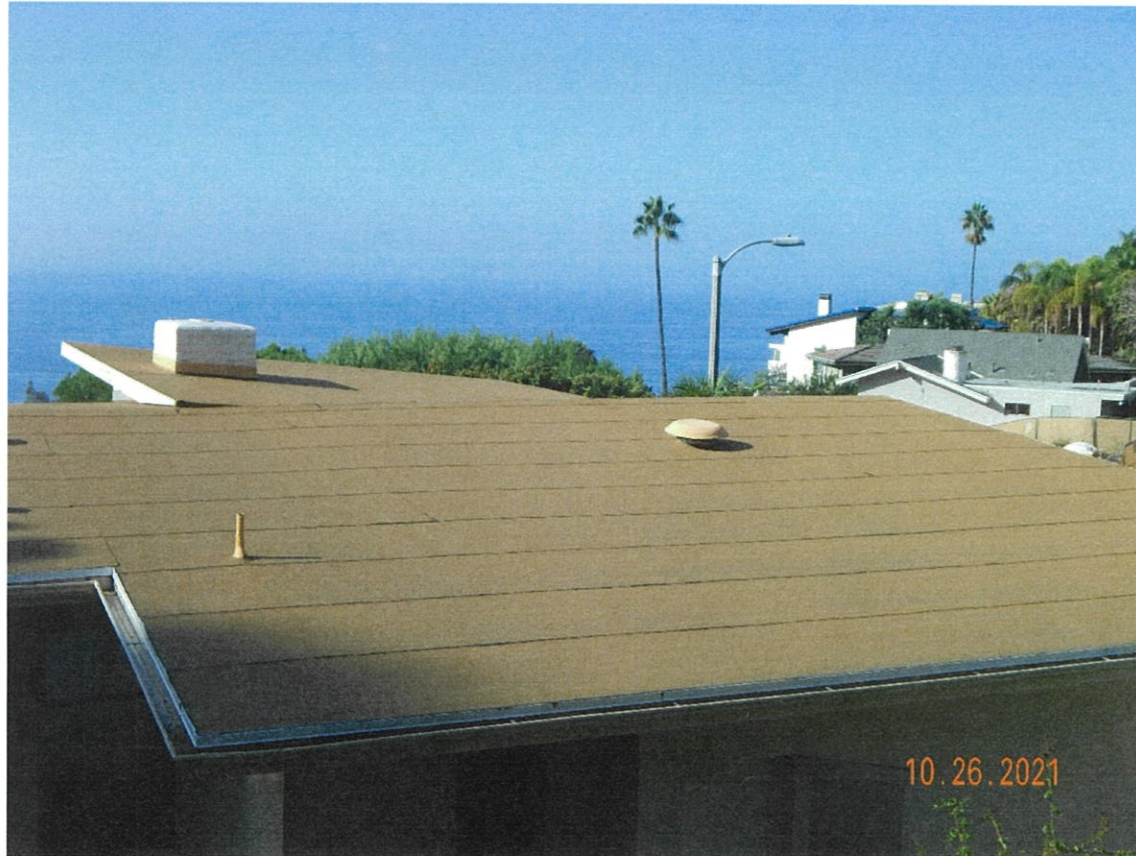
1126 Skyline Dr.

The photograph above was taken from the dining room on the main level of the primary residential structure.