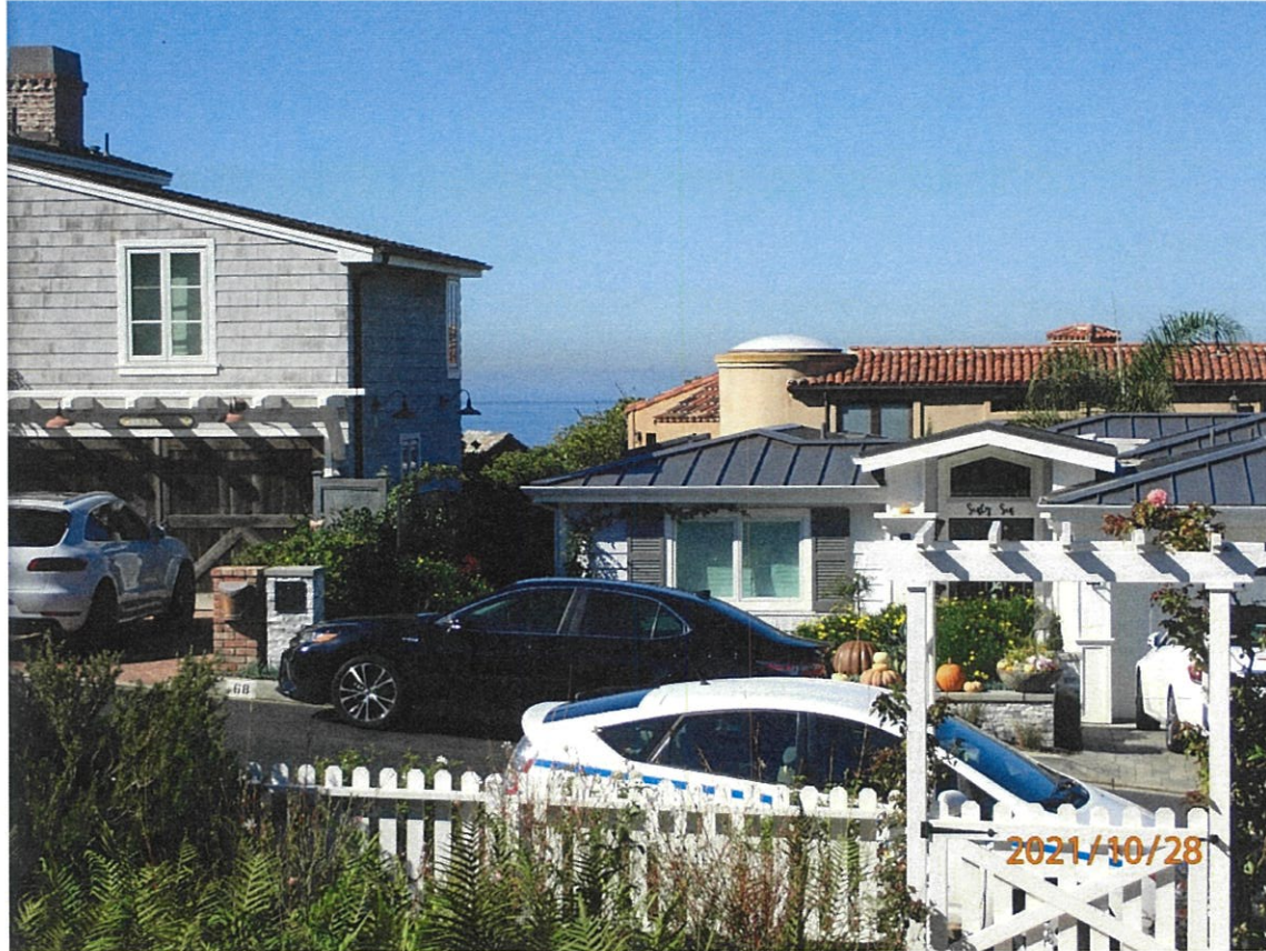
65 S. La Senda Dr.

The photograph above was taken from the living room on the main level of the primary residential structure.