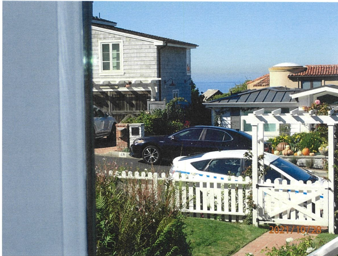
65 S. La Senda Dr.

The photograph above was taken from the living room on the main level of the primary residential structure.